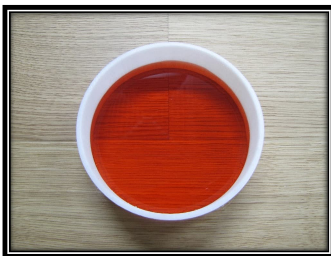
24 hrs With Water