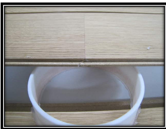
Recovered Swell (Disassembled)

Samples and their identifying descriptions have been provided by the client unless otherwise stated. NZWTA Ltd makes no warranty, implied or otherwise as to the source of the tested samples. The above results are designed to provide THE CLIENT WITH GUIDANCE INFORMATION ONLY. This document shall not be reproduced except in full.